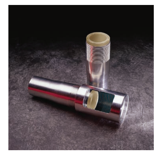
Solving Tubular Problems Under The Most Extreme Operating Conditions.