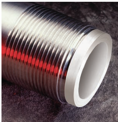
Liner face provides pin thread protection.