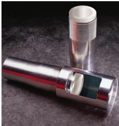
Coated couplings to protect J-area against corrosion.